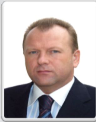
Marius L. VIZER IJF President