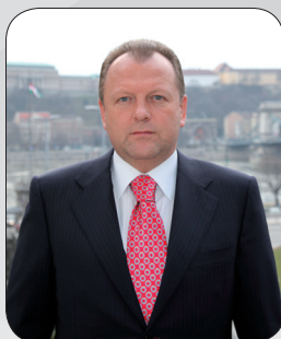
Marius L. VIZER IJF President