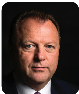
Marius L. VIZER IJF President

The second edition of the Budapest Grand Prix is a key event on the IJF World Judo Tour 2015.