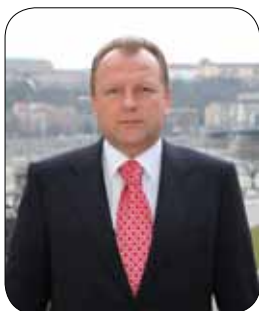
Marius L. VIZER IJF President

Dear participants of the Judo Grand Prix, Rijeka 2014, we are very pleased to welcome you to the second edition of this signature event to be held in Croatia.