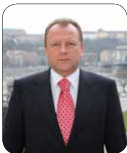
Marius L. VIZER IJF President

The first Judo Grand Prix in 2014 takes place in Düsseldorf, Germany in February. After the season-opening Paris Grand Slam, the judo family heads to Germany for another major event which has established itself on the World Judo Tour in recent years.