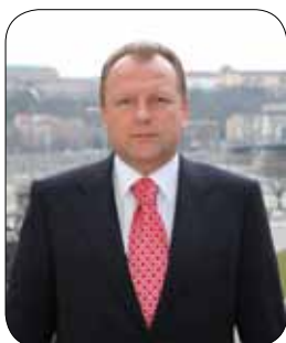
Marius L. VIZER IJF President

A new sports season starts again with the Judo Grand Slam in Paris. After an eventful 2013, which saw the establishment of the new refereeing rules, these new rules have been validated and will guide us throughout the Olympic qualification process that will begin later in 2014.