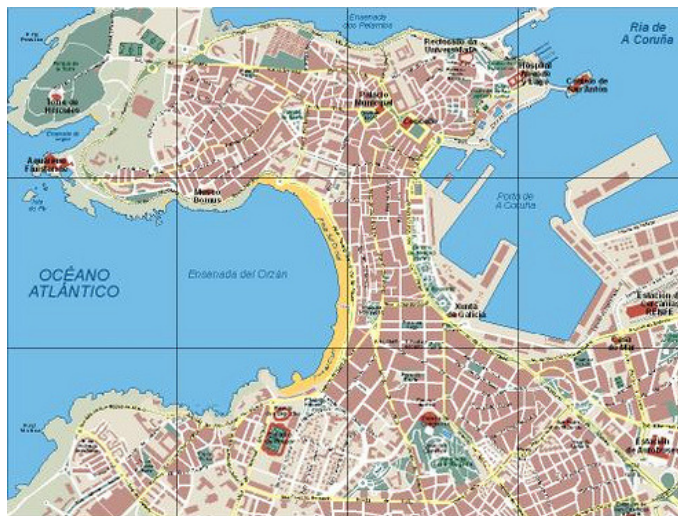
Ubicación de La Coruña / Location A Coruña

FEDERACIÓN GALEGA DE JUDO E D.A. - www.fgjudo.com galiciajudo@fgjudo.com