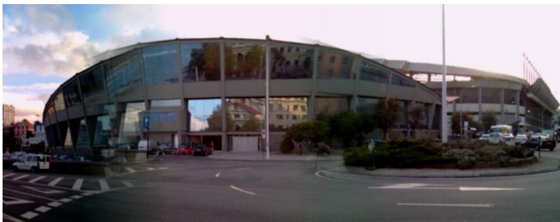
PALACIO DE LOS DEPORTES DE RIAZOR (A CORUÑA) -SPAIN Calle Manuel Murguía s/n 15011 A Coruña

For the latest news visit the FGJUDO homepage at www.fgjudo.com