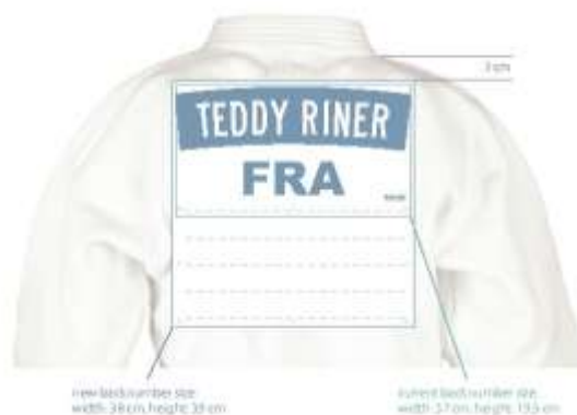
New back identification of athletes 01.01.2011

The bottom part consists of the Sponsor and the Name of the Event, which will be distributed during the accreditation.