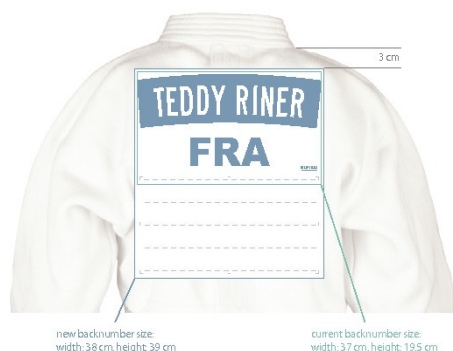
New back identification of athletes 01.01.2011